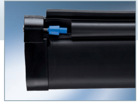
Principle of the crimp connection of the Optima-Plus connectors

The evaluation electronics monitor the safety strip, which is equipped with a terminating resistor and operates using the closed circuit principle. An amount of current defined by the resistance (8.2 kOhm) flows through the safety strip. When mechanical pressure causes the resistance in the safety strip to drop below 5.5 kOhm, this is recognised as an actuation (evaluation electronics: LED RED). When contact resistance or a broken cable raises the resistance in the safety strip above 11.5 kOhm, this condition is recognised as a broken cable and/or fault (evaluation electronics: LED YELLOW). In both cases, the system stops (evaluation electronics: safety relays K1 and K2 open)